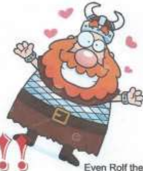
Even Rolf the Viking LOVES Fried Kumla!