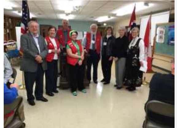
All of the Polar Star Pilgrims together for the first time to celebrate their Virtual Pilgrimage