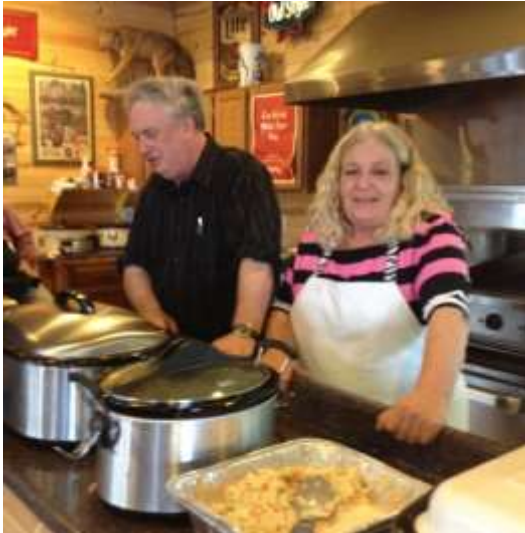
Andersen Tree Farm is located at the southwest corner of Ridge Road and Rout 126 – west of Plainfield, IL

Polar Star Midsummer Celebration at Anderson Tree Farm Sunday June 6, 2016 Potluck Picnic begins at 1:30 p.m. Bring picnic table service and a picnic dish to pass.