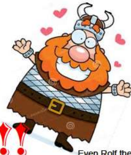
Even Rolf the Viking LOVES Fried Kumla!