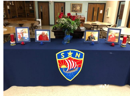
Polar Star Remembrance May Lodge meeting