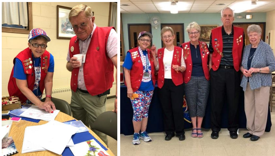
Polar Star Virtual Walkers earn Gangemerke Medals