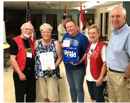
BLUE team UFFDA winners .