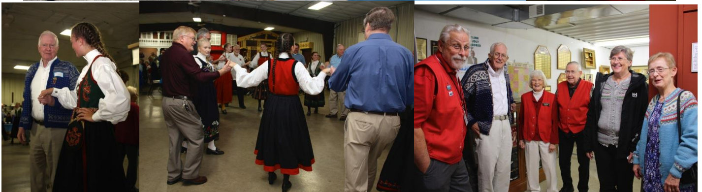
Polar Star members enjoy the entertainment from the Stoughton Norwegian Dancers at the Slooper Annual Meeting