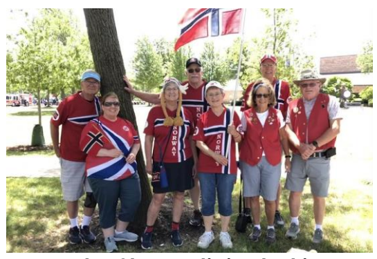
Polar Star participated in The June 28<sup>th</sup> Swedish Day Parade

Editor's Note... Be prepared...Our Norwegian Choir may be re-uniting for one song!