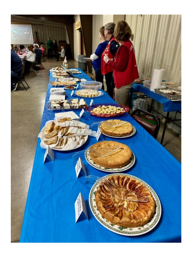
Polar Star and Cleng Peerson Dessert Table