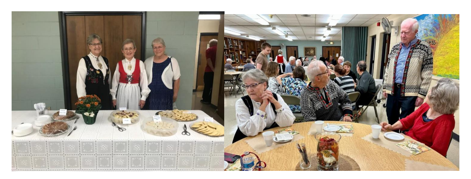
Polar Star Lodge congratulates and thanks St. Olaf Church for 135 Years of Serving their Community.