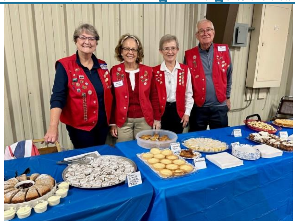
I think we should start with dessert!