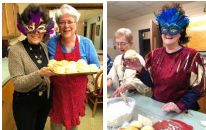
Polar Star fastelavnsboller baking

Later it became the children's special right to flog their parents on this day. In any case, the reward given for the flogging would be a fastelavnsbolle.