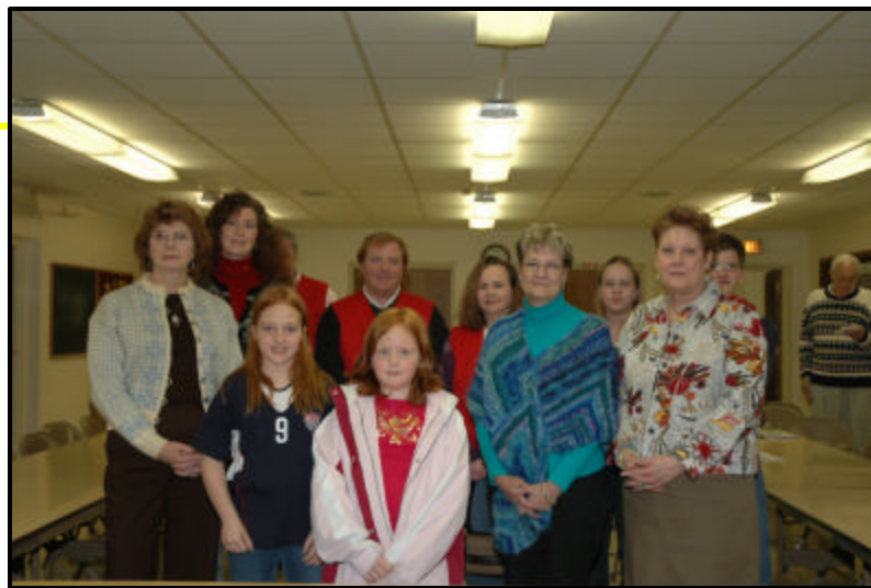
Our New Members. Picture from Jan 07 meeting