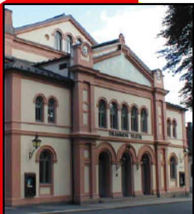
The Theater in Drammen, where you would go to see play not a movie.