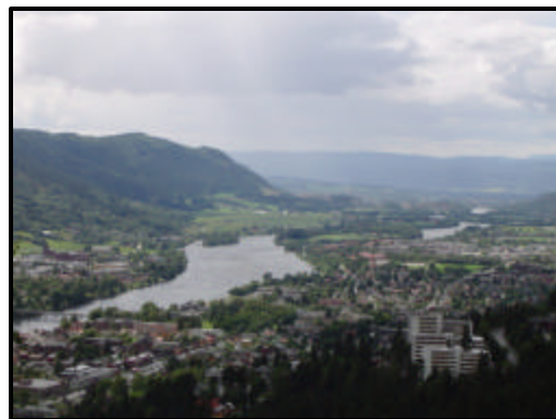
Picture from Spiralen over Drammen to the North