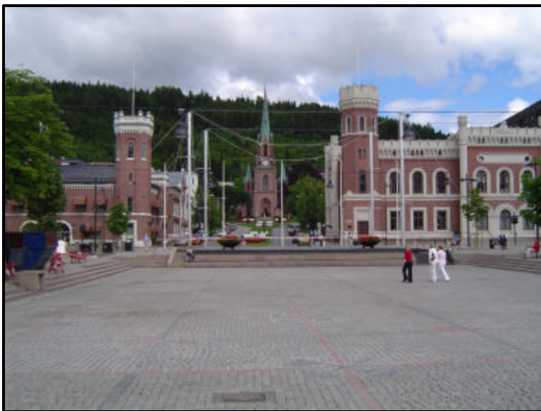
Picture from Drammen Torg to the North toward Bragernes Kirke (Church)

PS. This newsletter is available in color on our website