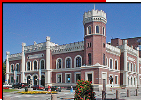
The old Fire Station in Drammen