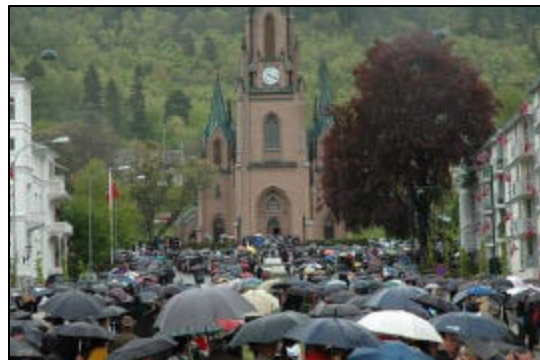
Drammen 17 May, 2008 Cold and rain..

is an interesting experience to meet and greet the number of visitors that come through. The annual "cleaning" of the museum will be on Saturday, May 24, beginning at 9:00 a.m. The Norway Store is also an interesting place to "stop in"